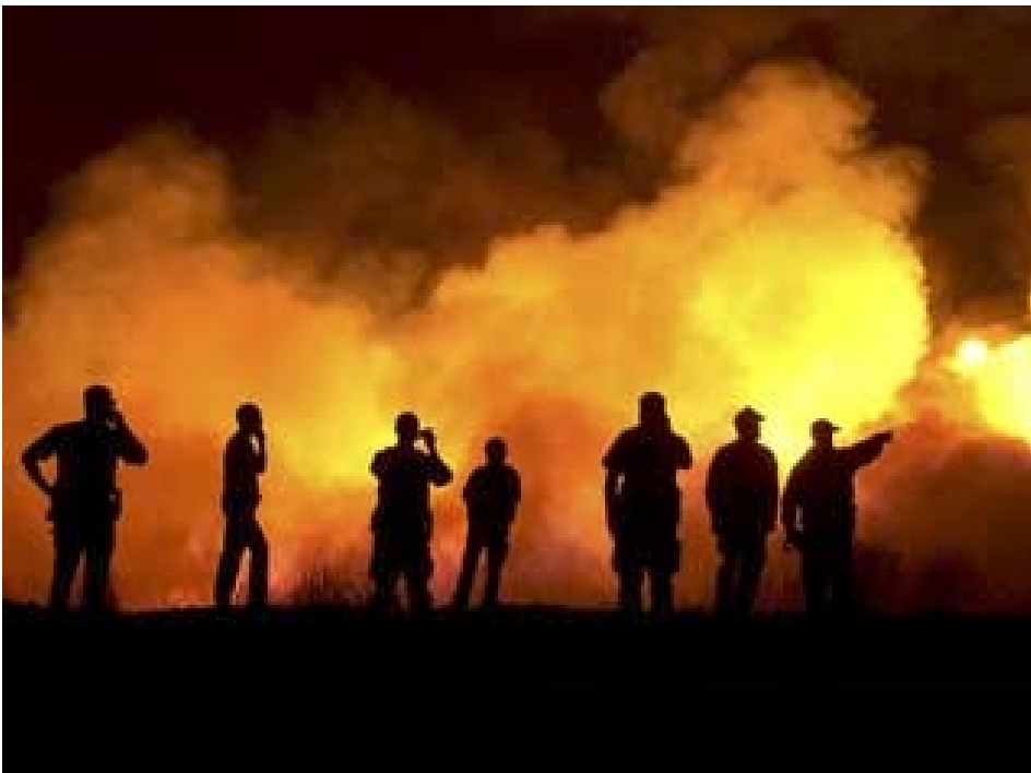
Below Firefighters at Alpine