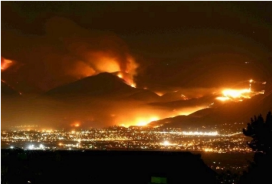
Above: El Cajon Valley Oct 26th 2003