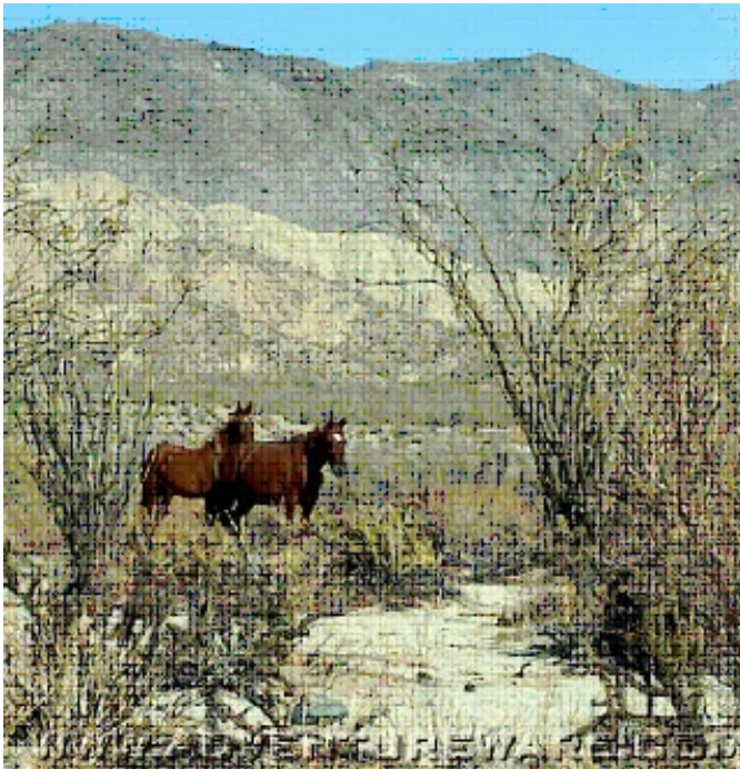
(L) Mares in the Canyon prior to removal, picture taken from < www.adventureware.com >. All of the mares are now in S. Dakota (below) Stallions waiting at Ridgecrest.